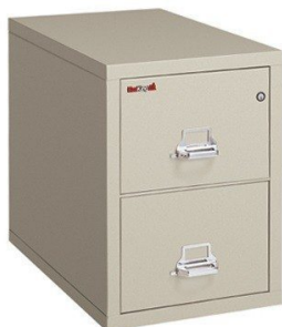
Fire King 2 Drawer Legal Vertical File Cabinet