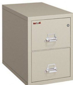
Fire King 2 Drawer Letter Vertical File Cabinet