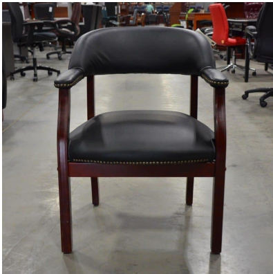
Black Captain's Chair