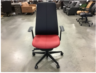
Haworth Fern Leather