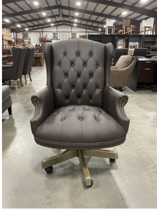
Wingback Traditional Desk Chair