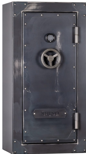
Rhino Strongbox RSX6030