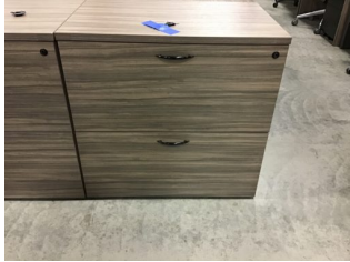
30" 2-Drawer Lateral File