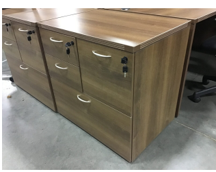
36" Combo File Cabinet