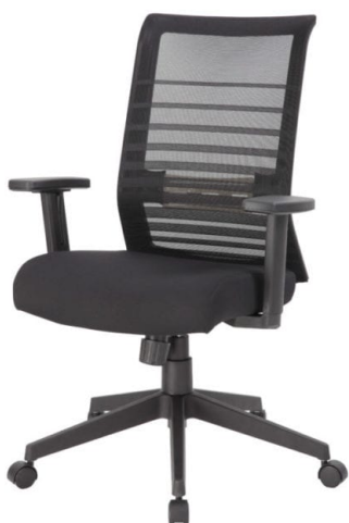
Boss Horizontal Mesh Back Task Chair with Synchro- Tilt Mechanism