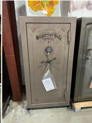
Superior Safe Regal SR-25