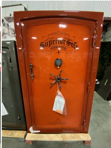
Superior Gun Safe SM-50