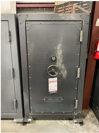
Rhino Strongbox RSB7242EX Safe