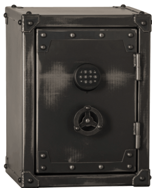
Ironworks LSB2418 Personal Safe