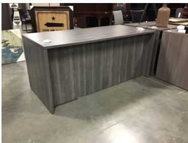
66" x 30" Desk w/Single Ped BBF