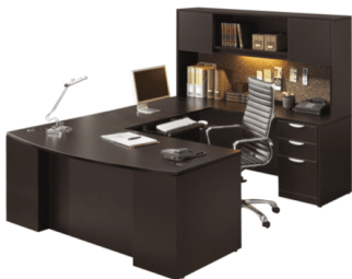
Bow Front U-Desk with Credenza and Hutch PL Series