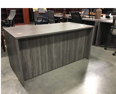
66" x 30" Desk w/Hanging Ped