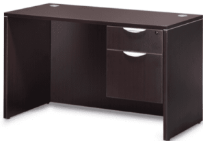
48" X 24" Single Pedestal Desk